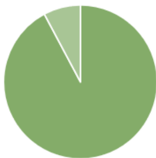
Scope 1 & 2 Emissions

We are committed to working and collaborating with businesses which seek to improve their sustainability, adopt ethical business practices, and care for people and planet. We will continue to improve our vendor selection processes and collaborate with our supplier and partners to increase awareness and share best practices.